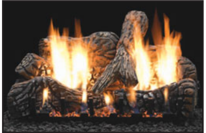
Ceramic Fiber Charred Oak Log Set (LS-24C2) with Slope Glaze Burner System (VFSR-24)

Even our manually controlled log sets offer three heat levels, so you can keep the cold winds at bay without overheating the room.