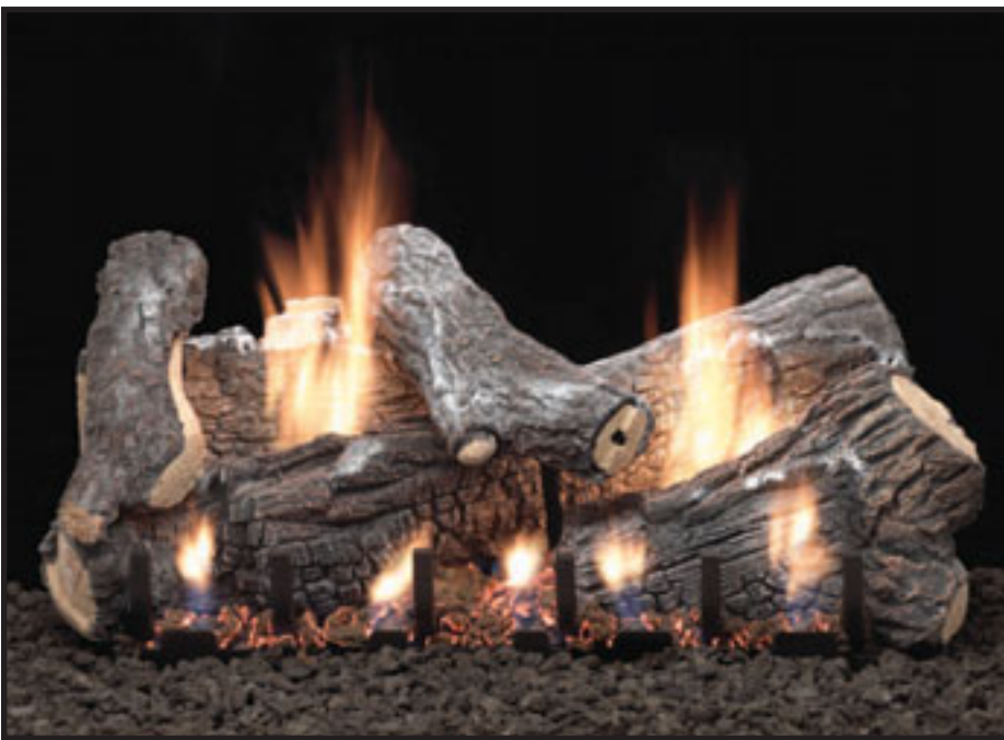
Refractory Sassafras Log Set (LS-24RS) with Slope Glaze Burner System (VFSR-24)