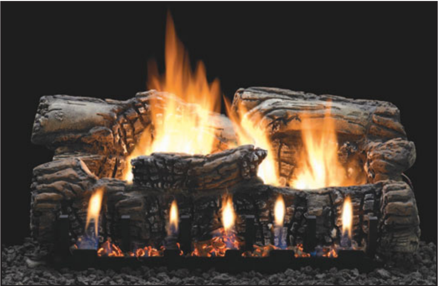
Ceramic Fiber Hickory Log Set (LS-24H) with Slope Glaze Burner System (VFSR-24)