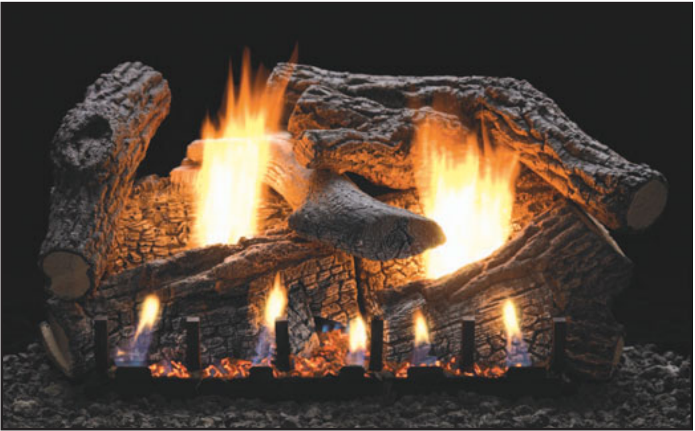
Refractory Super Sassafras Log Set (LS-24RSS) with Slope Glaze Burner System (VFSR-24)