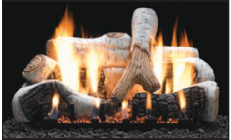
Ceramic Fiber Birch Log Set (LS-24B2) with Slope Glaze Burner System (VFSR-24)