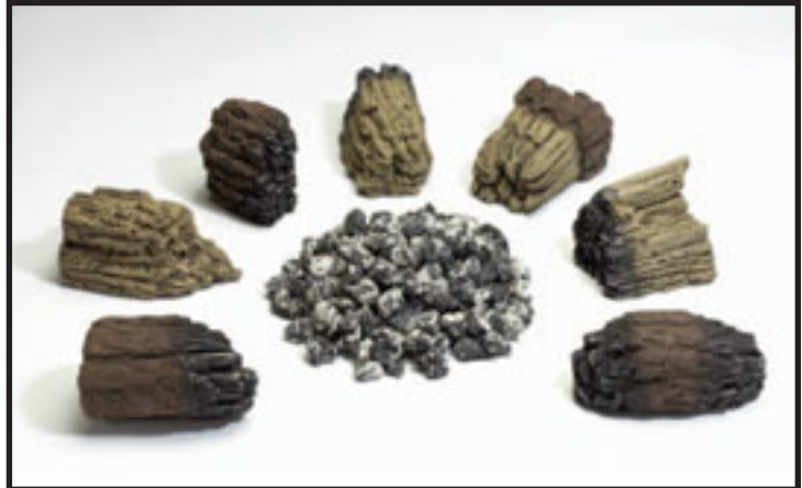
EK-2 Large Log Ember Kit includes seven large burnt log pieces and white ash