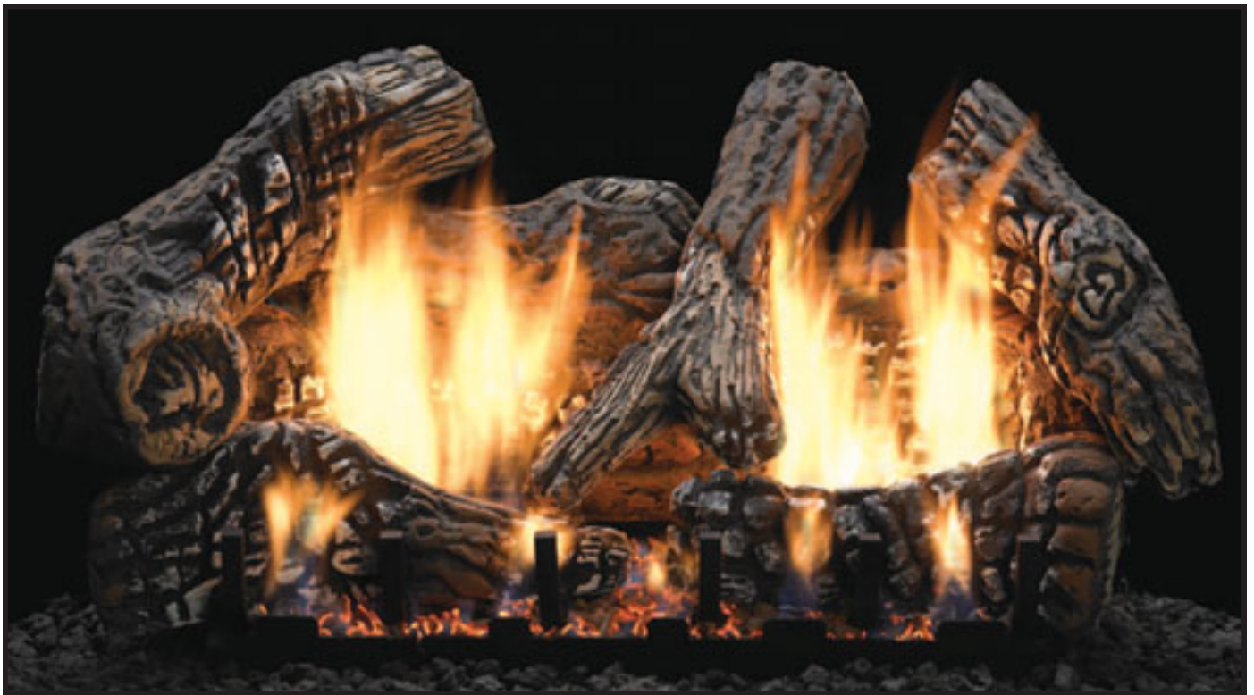
Ceramic Fiber Super Charred Oak Log Set (LS-24C2S Shown) with Slope Glaze Burner System (VFSR-24)