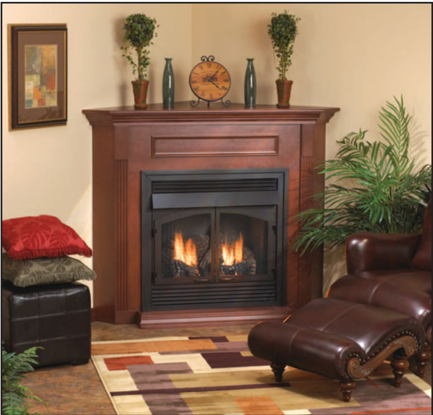
White Mountain Hearth Charred Oak Log Set (LS-24C2) on a Vent-Free Slope Glaze Burner with variable remote control system (VFSV-24). Shown with a 36-inch Breckenridge Deluxe Vent-Free Firebox with Brick Liner (VFD36FB) trimmed in black louvers, black hood, and shown with optional black frame, black door frame and black arch doors (DVF-36BL, VFY-36-SBL, and VFR-36-SCBL). The Cherry Finish on the Standard 36-inch Corner Cabinet Mantel (EMC-36-C) adds drama and warmth to any setting.

Empire Comfort Systems created the White Mountain Hearth collection to give you more options in a gas log set. With several distinct log looks, in sizes from 16 to 30 inches, this special collection helps you tailor your hearth's look to top off any room décor. Choose from our traditional lines – charred oak (our most popular log), sassafras, birch, aged oak or hickory. Our Super Log Sets boast bigger logs and more of them - choose Charred Oak, Sassafras or Ponderosa. Our Flint Hill ceramic fiber log and burner combinations provide exceptional realism at a competitive price. Our all-new Rock Creek and Stone River Multi-Sided Log Sets look great from any angle, making them ideal for see-through, island, and peninsula fireplaces.