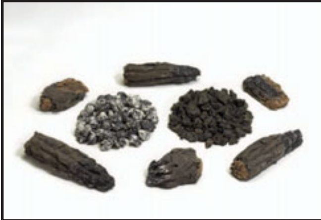
EK-1 Traditional Ember Bed Kit includes six burnt log pieces, white ash, and lava rock