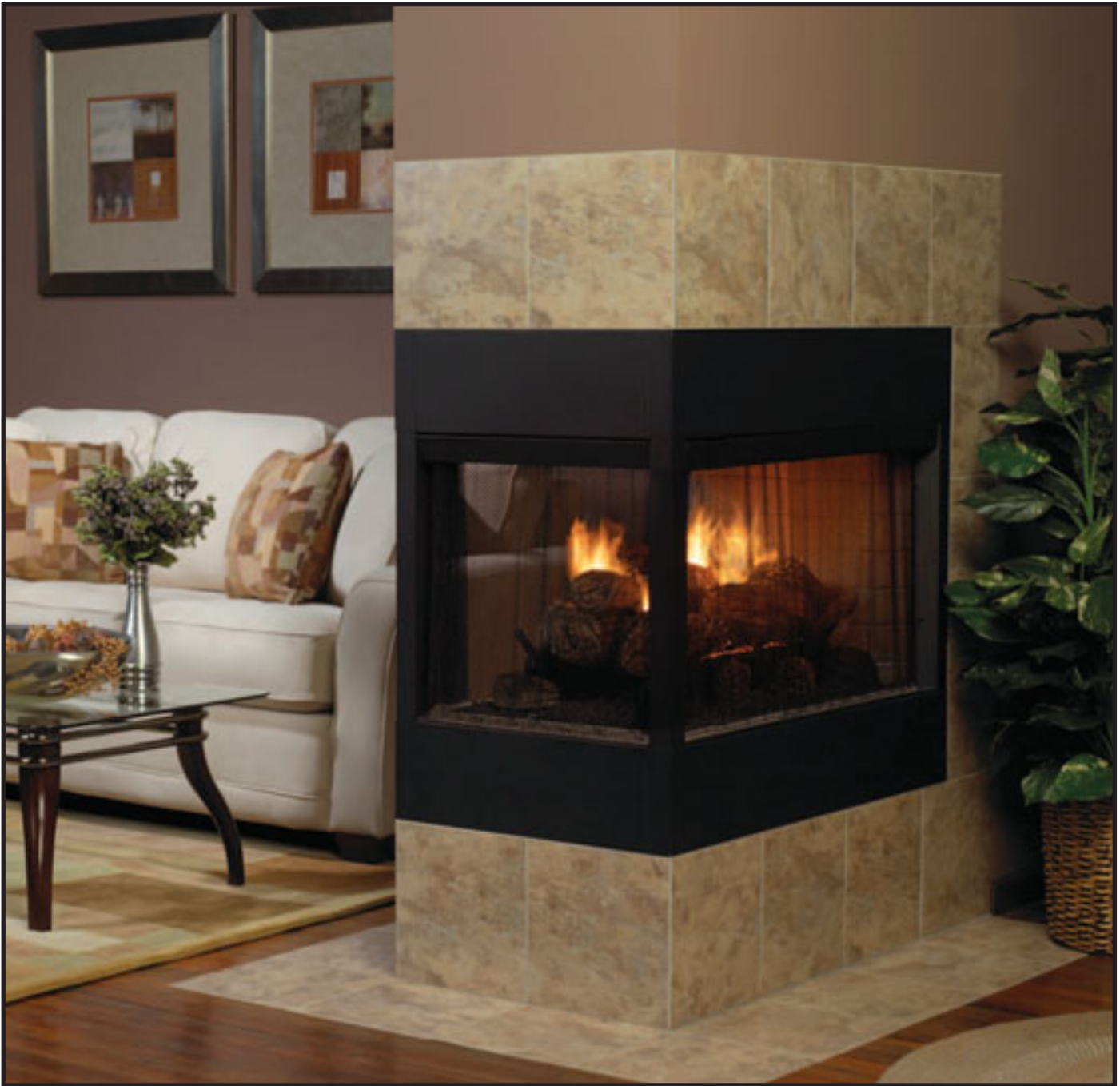
White Mountain Hearth Stone River Log Set (LSU-24SF) on a Vent-Free Slope Glaze Vista Burner. Shown in a peninsula firebox with custom tile surround. The optional Large Log Embers Kit (EK-2) and Platinum Glowing Embers (PE20-12) add that extra spark of realism.