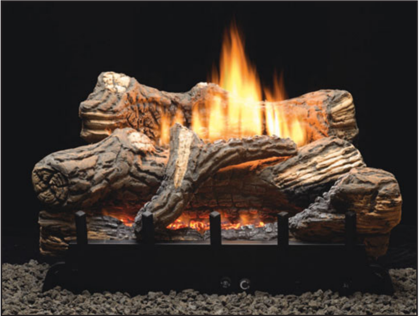
Ceramic Fiber Flint Hill Log Set and Burner Combination (VFDR-24)

The Flint Hill is also offered in a 10,000 Btu model for bedroom applications, where allowed by code.