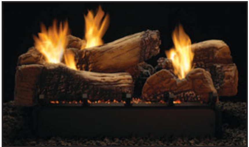
Opposite Side View