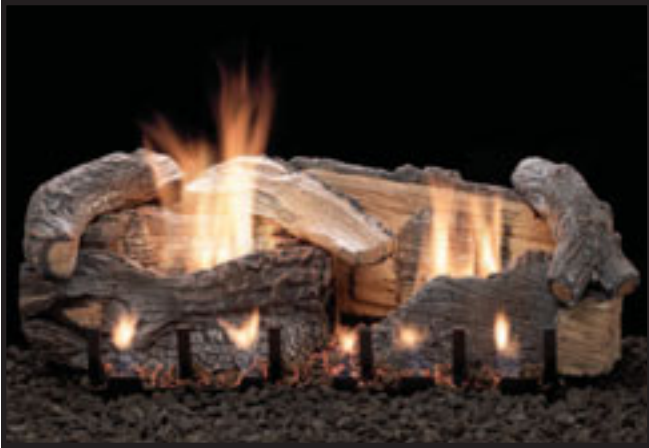
Refractory Aged Oak Log Set (LS-24RA0) with Slope Glaze Burner System (VFSR-24)

White Mountain Hearth log sets combine our proven technologies with exceptional artistry and craftsmanship to add beauty and warmth to any home.