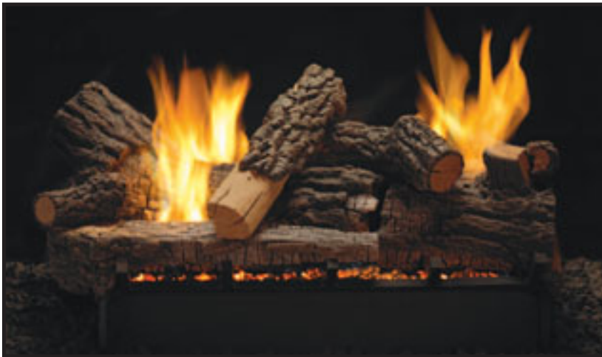
Opposite Side View