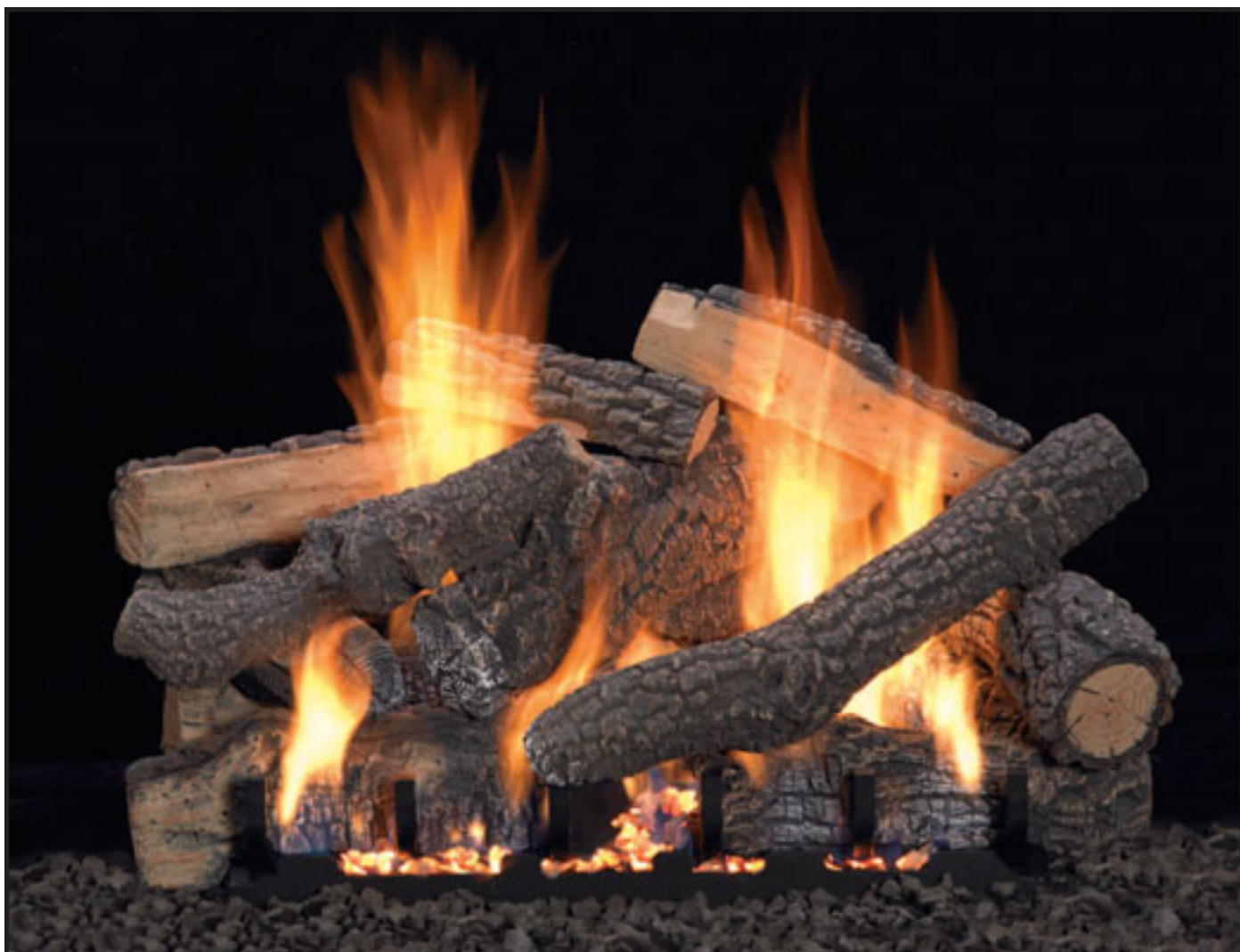
Refractory Ponderosa Log Set (LS-24P) with Vented Slope Glaze Burner System (VSR-24)