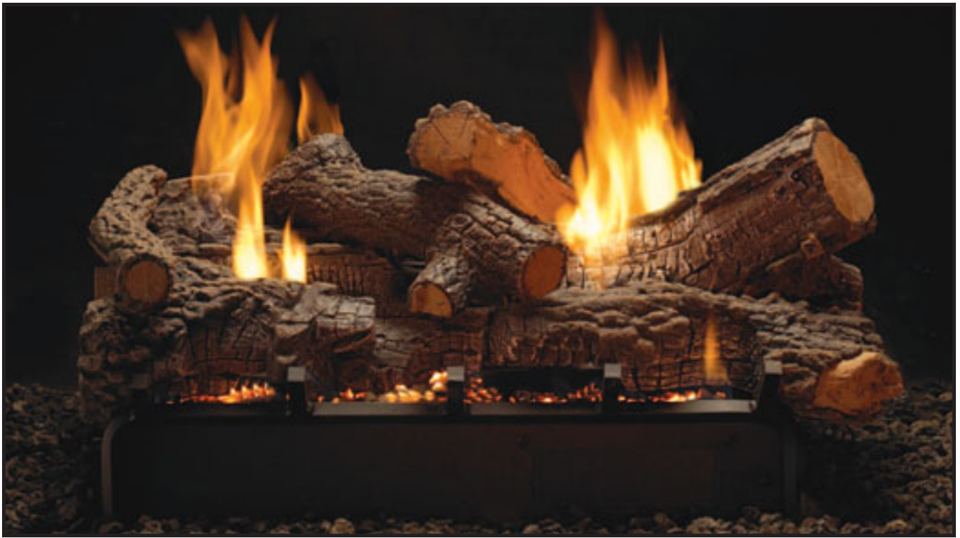
Rugged looking refractory logs, give the Rock Creek Log Set a rustic look on a grand scale.